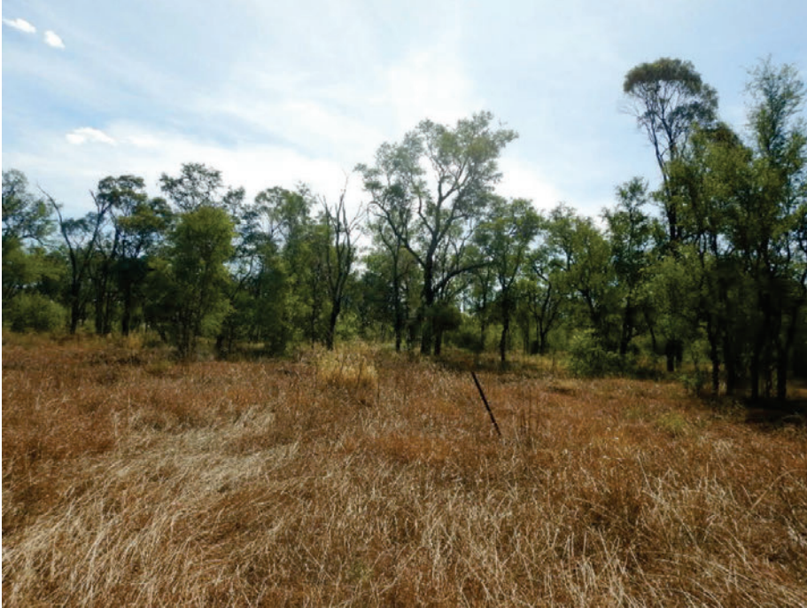
Plate 1: Picardy Station offset area. Monitoring Site M9