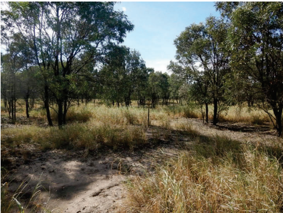
Plate 2: Picardy Station offset area. Monitoring Site M3