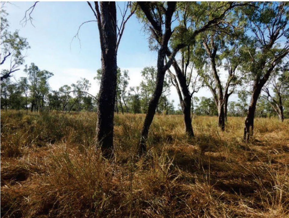
Plate 4: Picardy Station offset area. Monitoring Site M7