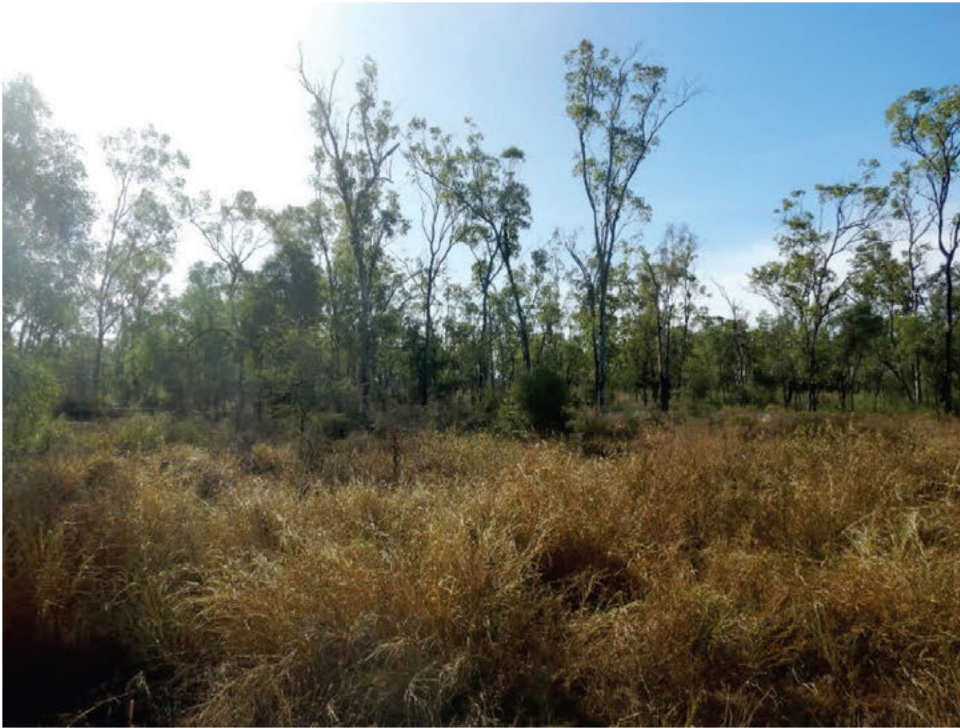
Plate 3: Picardy Station offset area. Monitoring Site M2