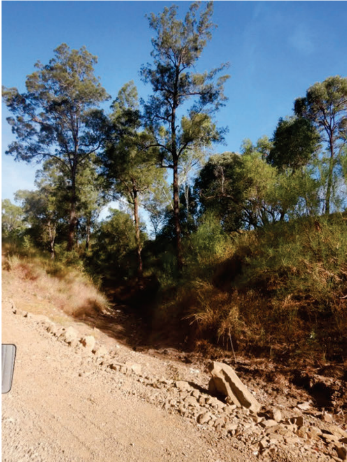
Plate 5: Within Picardy Station offset area along Stephens Creek