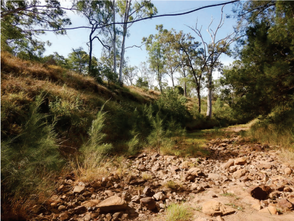
Plate 6: Within Picardy Station offset area along Scott Creek