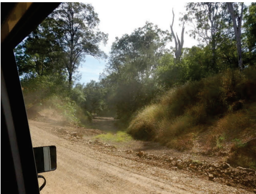
Plate 6: Within Picardy Station offset area at the headwater of Stephens Creek and Scott Creek