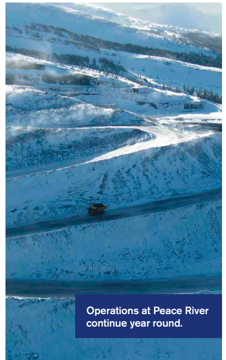
Operations at Peace River continue year round.