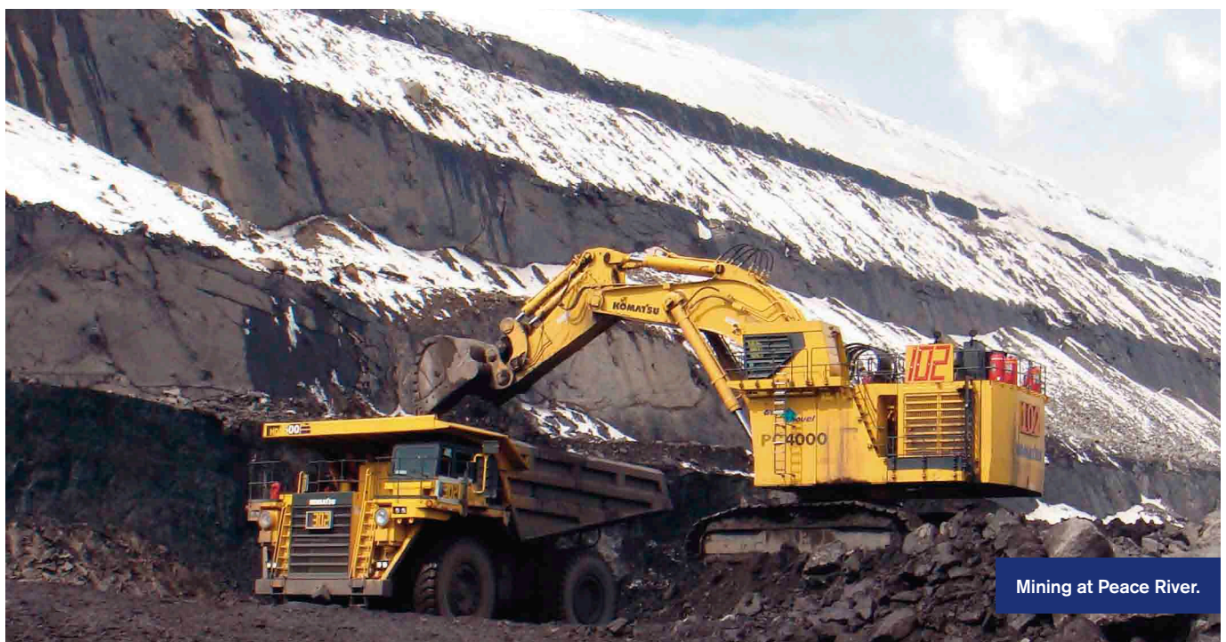
Mining at Peace River.