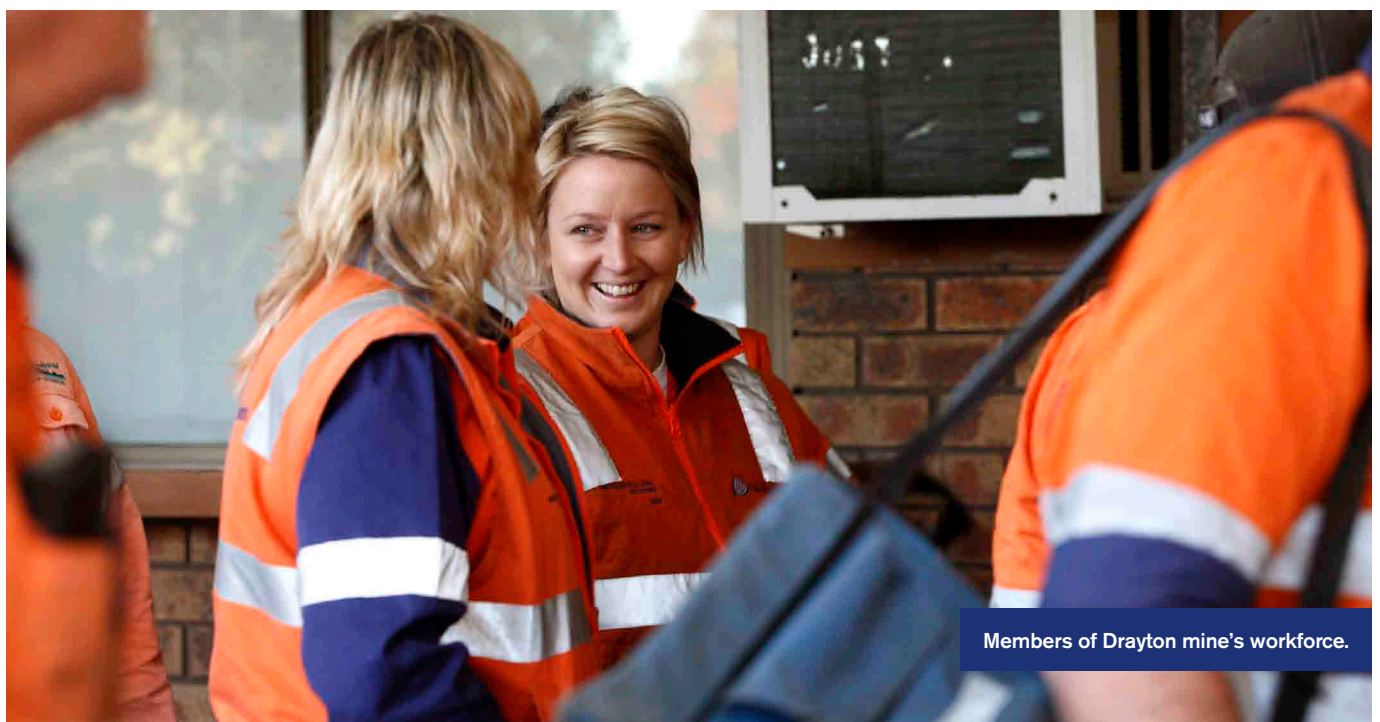
Members of Drayton mine's workforce.